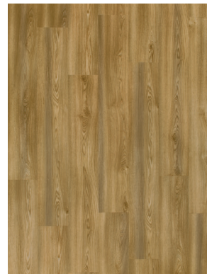
COLUMBIAN OAK 226M 60000593