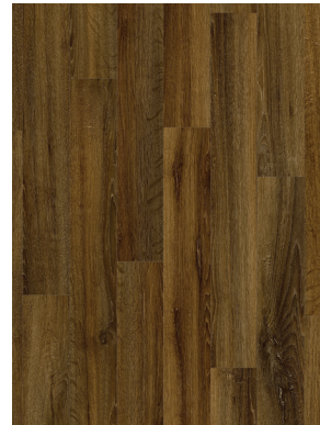
LIME OAK 954D 60000608