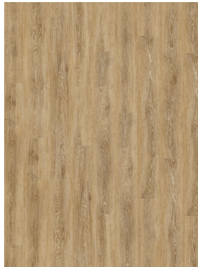
TOULON OAK 293M 60000616