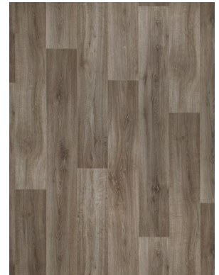
LIME OAK 996D 60000613