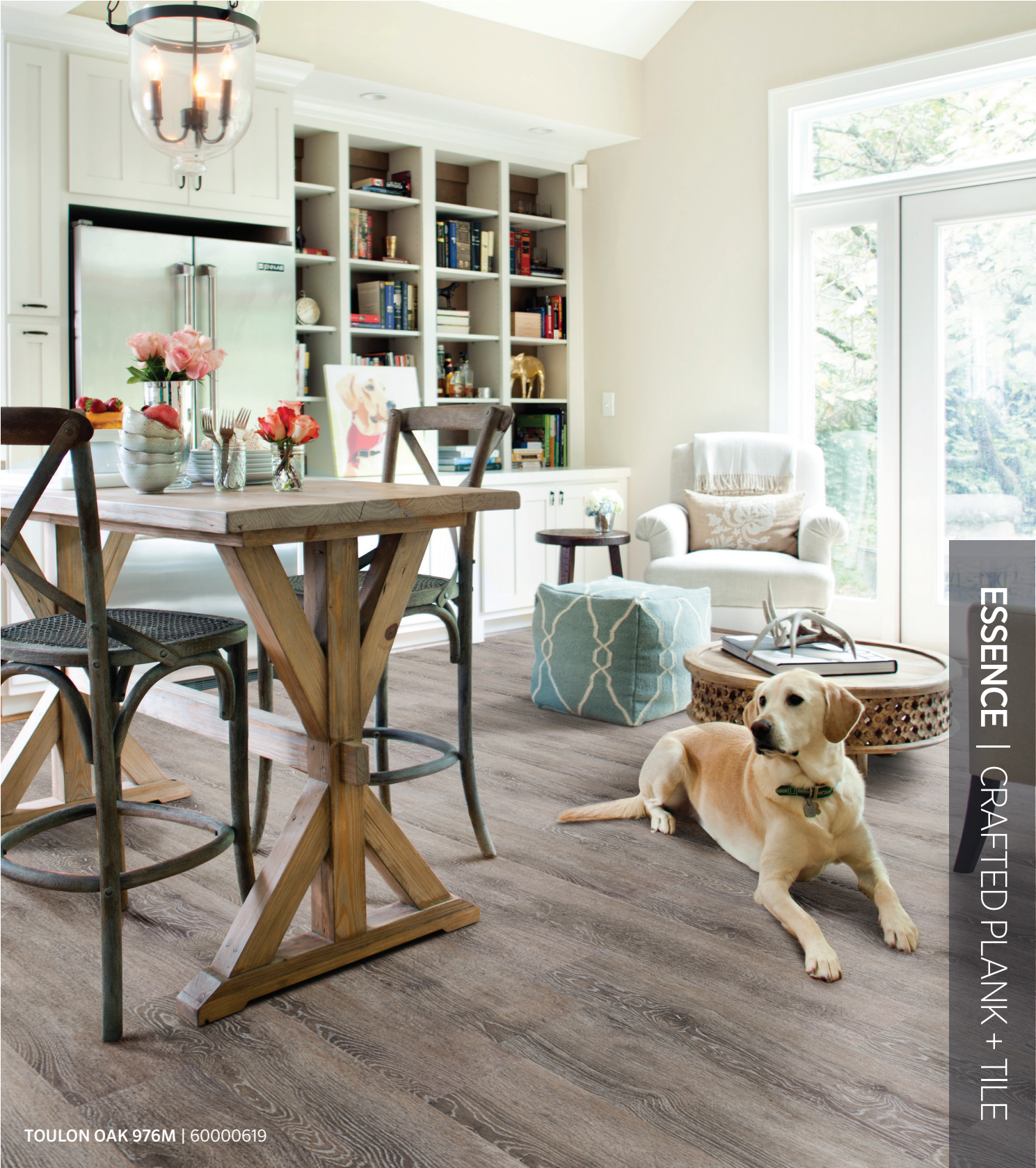
TOULON OAK 976M | 60000619