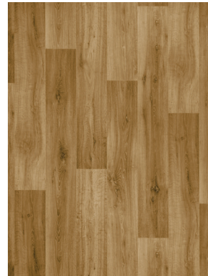
LIME OAK 623M 60000604