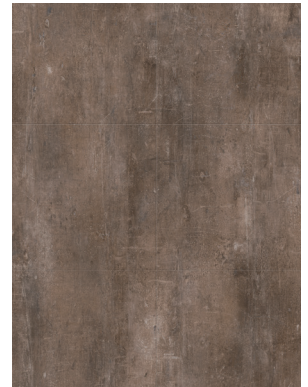
ZINC 679M 60001061