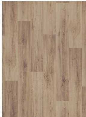
LIME OAK 669M 60000605

Plank Size: 19.21" x 38.43" Box: 9 tiles Sq.Ft./Box: 46.14