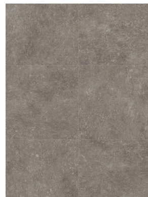
DISA 797M 60001059