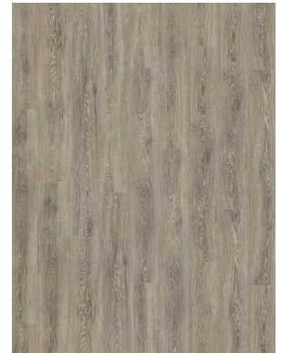
TOULON OAK 976M 60000619