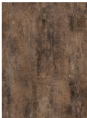
ZINC 373D 60001060