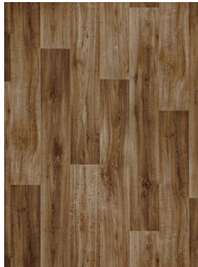
LIME OAK 966D 60000610