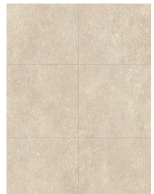
DISA 101S 60001058