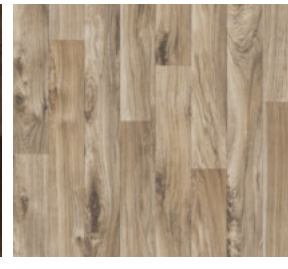
MIDLAND HICKORY OAT 50045948