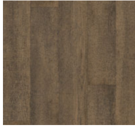
BARNWOOD CROSSING COFFEE 50045946