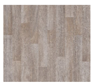
CAPITOL OAK MINK 50045945