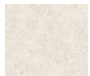
COLLECTIVE IVORY 50045957