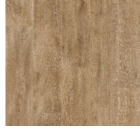
STATION OAK PEANUT 50045944