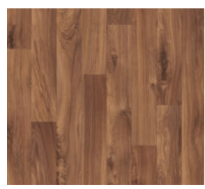
MIDLAND HICKORY SPICE 50045947