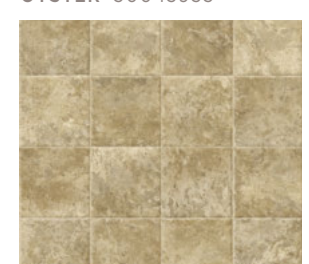
UPTOWN KHAKI 50045952