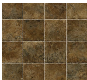
UPTOWN CHOCOLATE 50045951