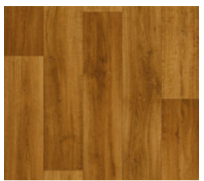
URBAN OAK GINGER 50045950