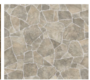
LABYRINTH STORM 50045958