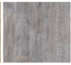
STATION OAK FOSSIL 50045943