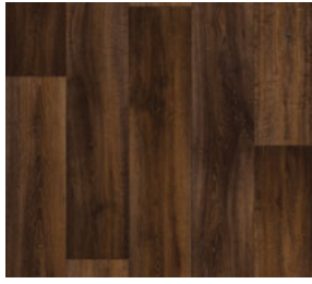
URBAN OAK BRUNETTE 50045949