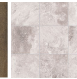
MAINSTREAM PEARL 50045956