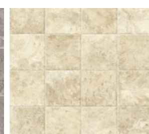
UPTOWN WHEAT 50045953