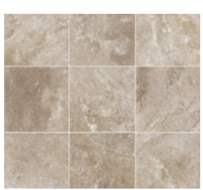
MAINSTREAM OYSTER 50045955