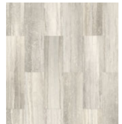
ASTRID SAND 50047133