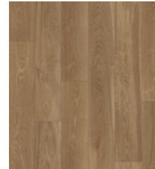
STELLAR OAK PEANUT 50047120