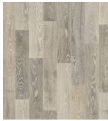
ODYSSEY OAK OAT 50046720