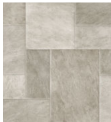
COSMOS SMOKE 50047125