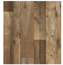
MOONWOOD BURLAP 50047136