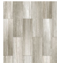
ASTRID OYSTER 50046719