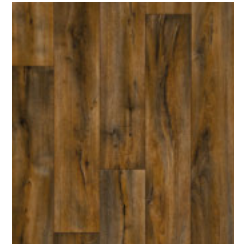
VEGA OAK PECAN 50046716