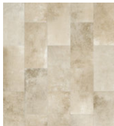
PANDORA BONE 50046721