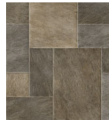
COSMOS STONE 50047124