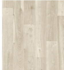
STELLAR OAK CREAM 50047122