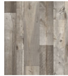
MOONWOOD CLOUD 50047137