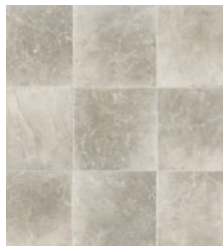
STARDUST SILVER 50047132