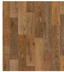
ODYSSEY OAK COFFEE 50047117