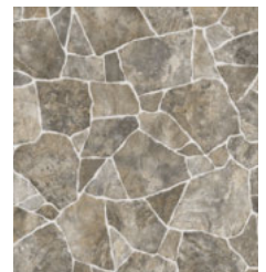
EARTHBOUND FOSSIL 50047138