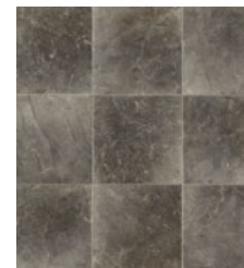
STARDUST CHARCOAL 50047130