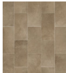
PANDORA MINK 50046722