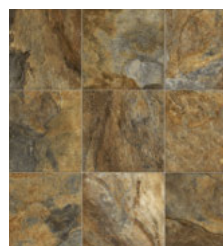
ECLIPSE AMBER 50046718