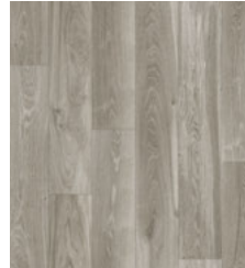
STELLAR OAK FOG 50047121