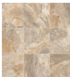
ECLIPSE PEARL 50046717