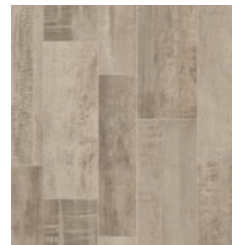
NEBULA ASH 50046715