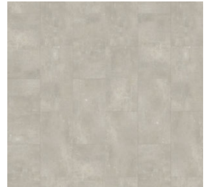
ZINC 967M FOG 60001626