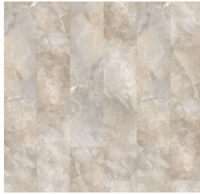
NEWCASTLE 169M DOVE 60001629