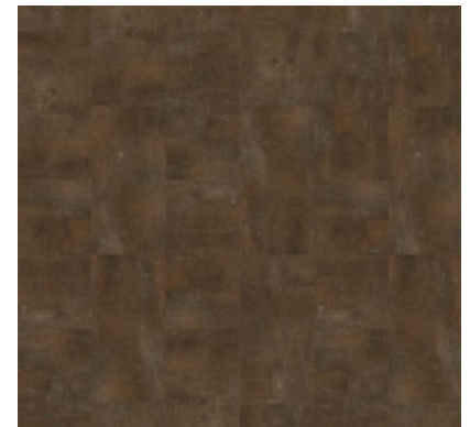
ZINC 373D STONE 60000086