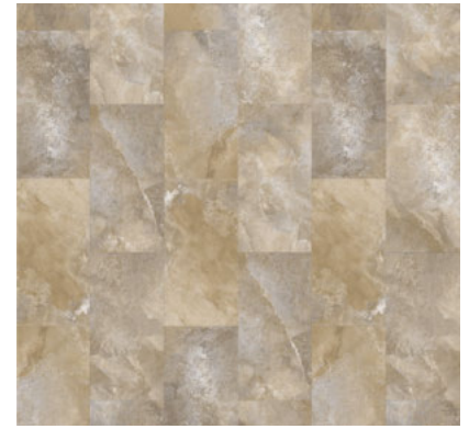
NEWCASTLE 963M SHELL 60001631