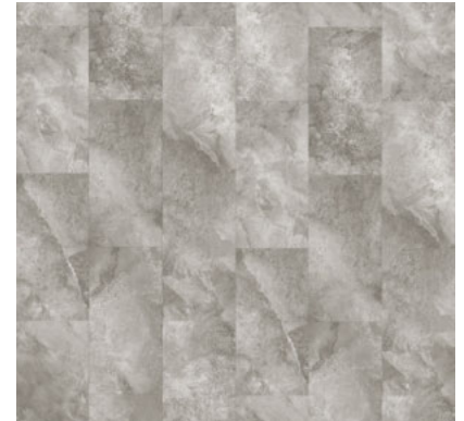
NEWCASTLE 909M SMOKE 60001633