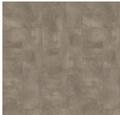
ZINC 679M UMBER 60000085