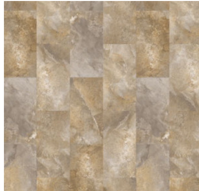
NEWCASTLE 369M CLAY 60001630