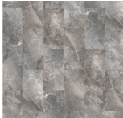
NEWCASTLE 796D SHADOW 60001632