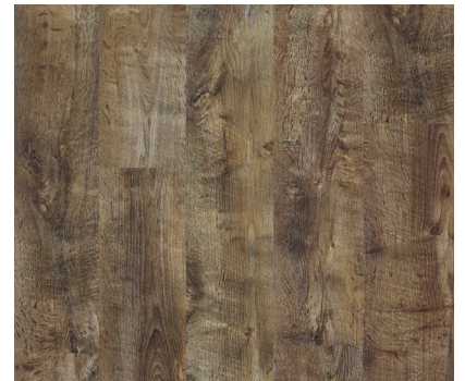
LONDON OAK 62001635