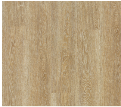
VIVALDI OAK 62001630