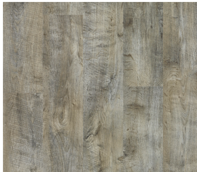
BRIGHTON OAK 62001634