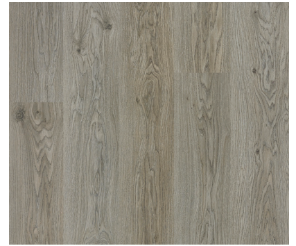
MAGNOLIA OAK 62001631