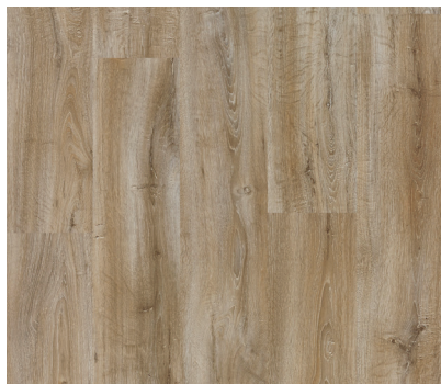
FIJI OAK 62001636