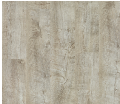
CAMBRIDGE OAK 62001632