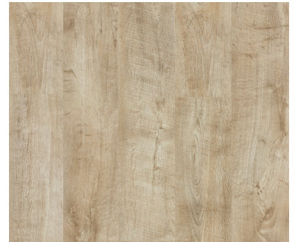
LIVERPOOL OAK 62001633